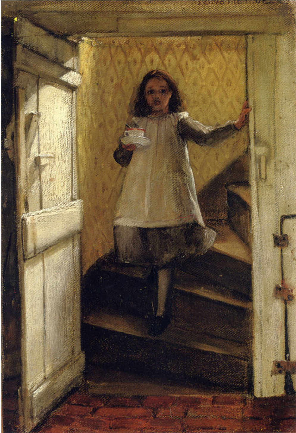
Girl on Stairs by Laura Theresa Alma-Tadema