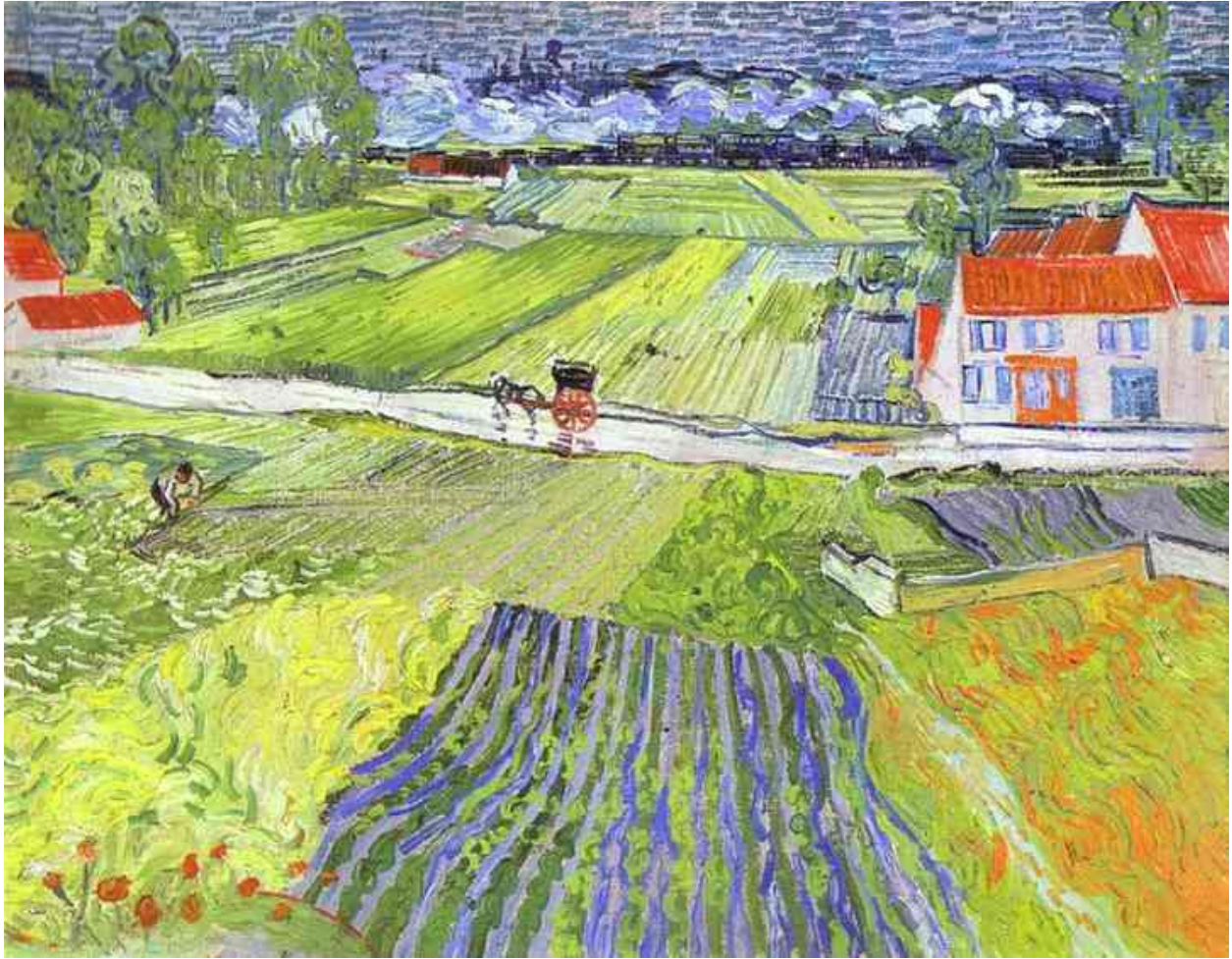
A Road in Auvers After the Rain by Vincent van Gogh